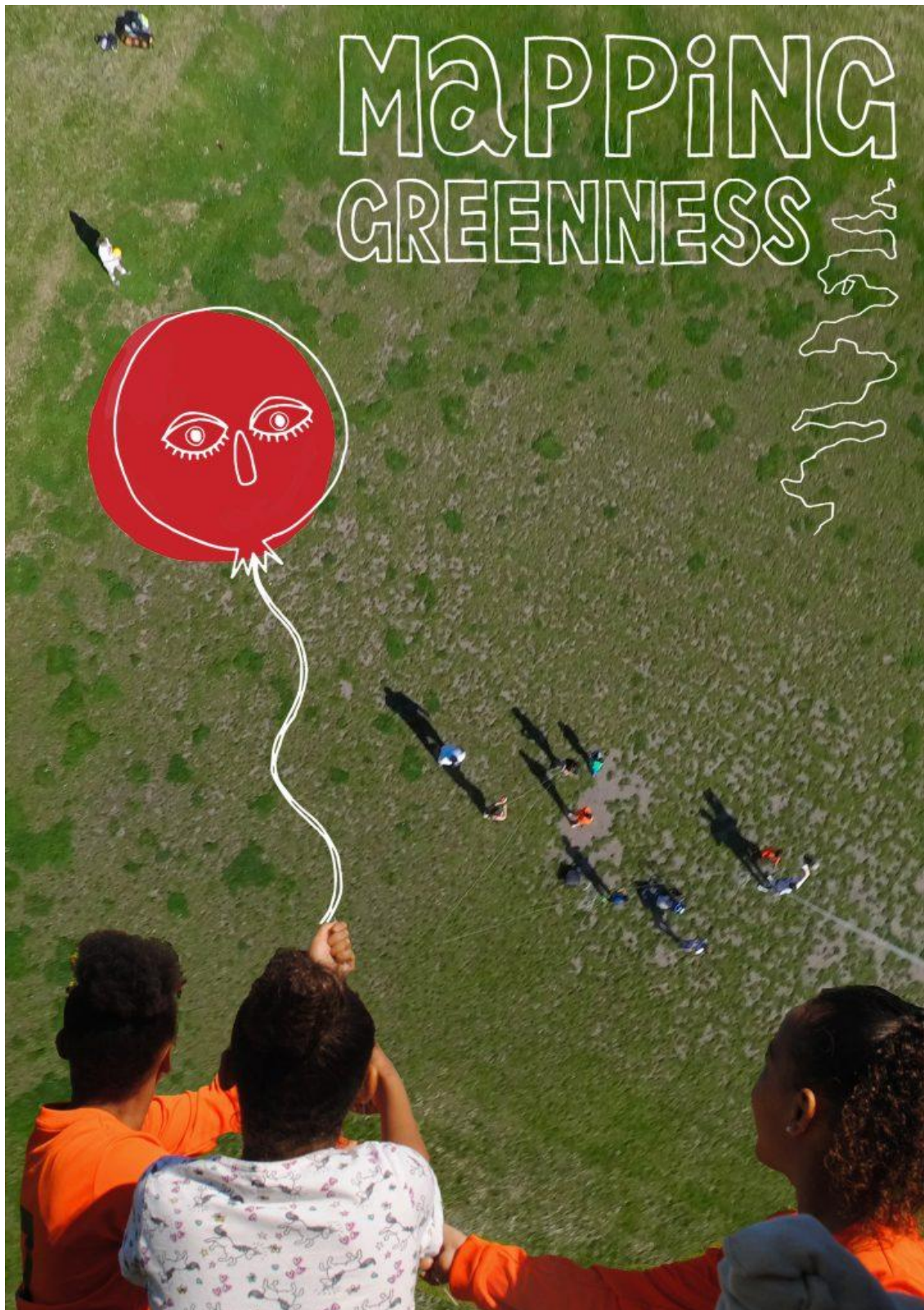
Mo Langmuir „Mapping Greenness“