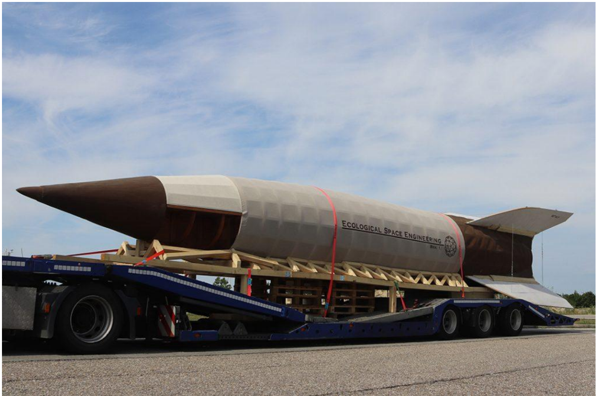
Jos Volkers „ Bioremediating Missile “

Press Images (to be used if naming the artists)