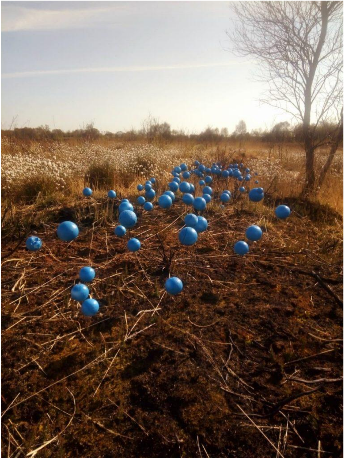
Rosalind Lowry „ Blue Yet Grass on the Boglands of Ireland “